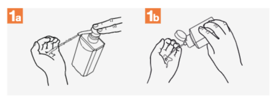
Apply a palmful of the product in a cupped hand, covering all surfaces;

Ouration of the entire procedure: 20-30 seconds