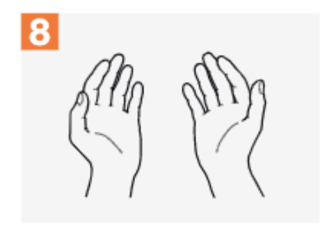
Once dry, your hands are safe.