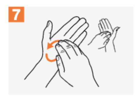
Rotational rubbing, backwards and forwards with clasped fingers of right hand in left palm and vice versa;