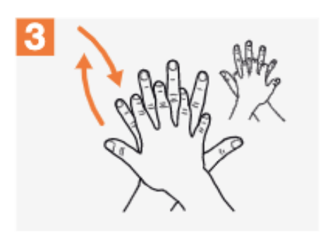
Right palm over left dorsum with interlaced fingers and vice versa;