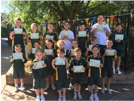
Term 4, Week 2