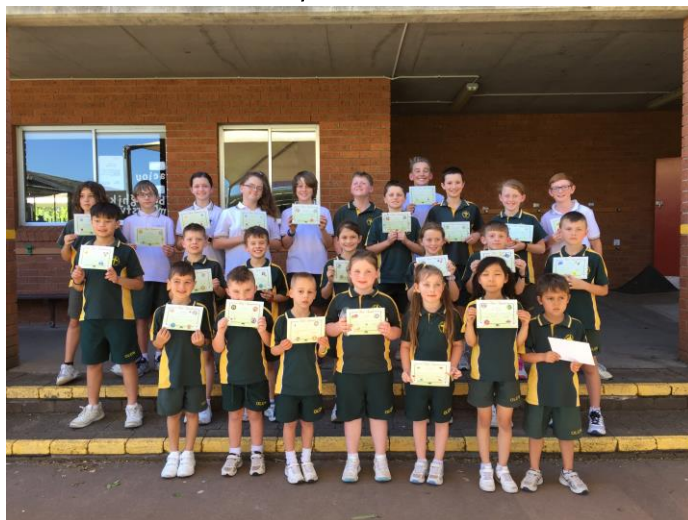
Term 4, Week 1 Awards