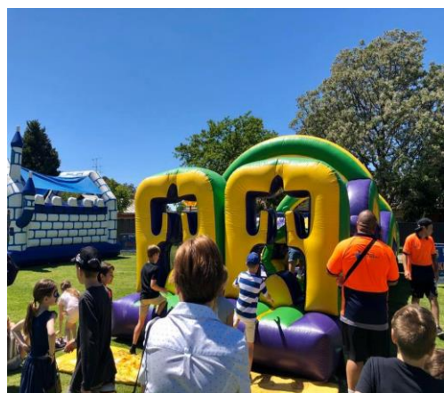
The jumping castle and obstacle course was a popular attraction on the day