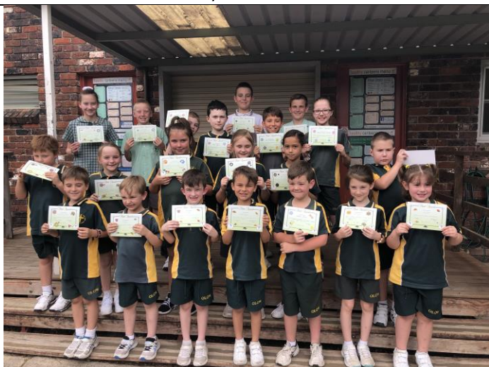
Term 4, Week 2 Awards