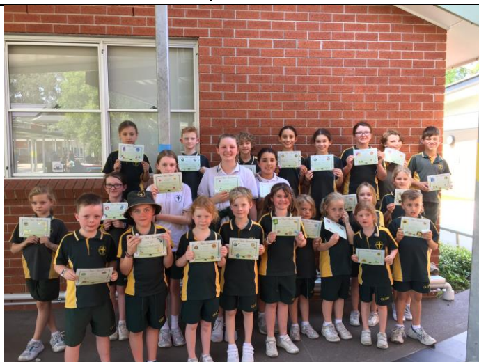
Term 4, Week 3 Awards