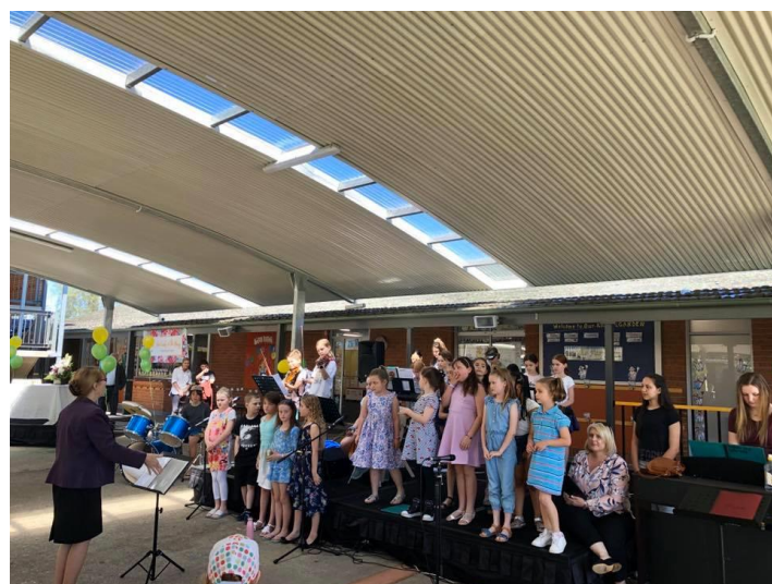
The choir and band did an amazing job entertaining the crowd